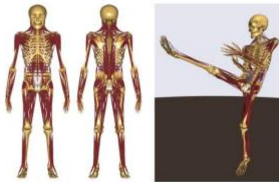
Fig.2. Multibody musculoskeletal manikins from the AnyBody software.

2 Multibody musculoskeletal simulation A musculoskeletal model is a model of the musculoskeletal framework, more often than not characterizing the bones as inflexible bodies obliged by joints with muscles going about as power and development generators, that are utilized to break down athletic execution, evaluate musculoskeletal burdens, digestion, neuromuscular coordination and so on. The product utilized as a part of this theory is the Anyone modeling framework (Anyone Innovation) which is likewise the one portrayed in this section. Other musculoskeletal modeling frameworks, like Anyone are SIMM/FIT (Musculographics Inc) and BRG.LifeModeler (Biomechanics Exploration Gathering, Inc).