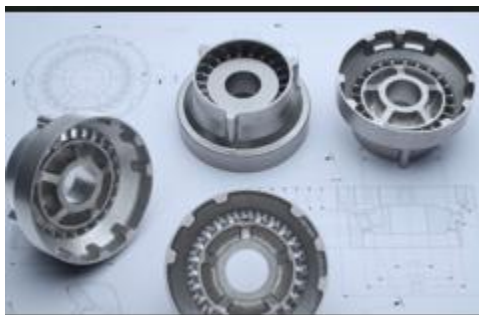
Fig.1 Examples of parts manufactured with AM.

The most widely recognized utilization of AM innovation in 2012 was for coordinate part generation and useful models. Concerning use, in 2012 the